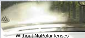
Without NuPolar lenses

World Market Leader in Polarized Rx Lenses